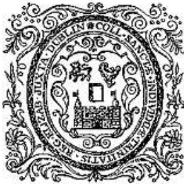
Seal of Trinity College, Ireland